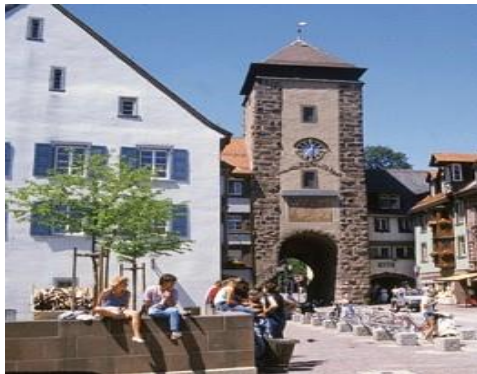
One of Villingen's Towers