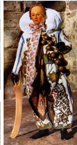
Traditional Carnival Costume in Villingen