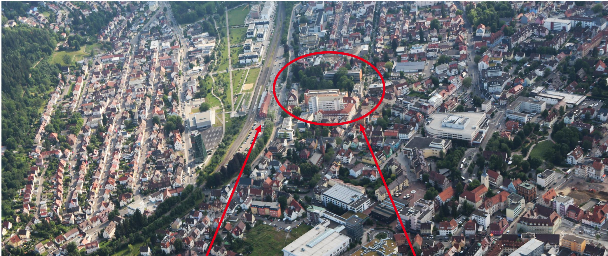
Train station of Schwenningen