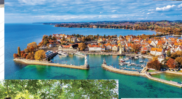
Lake of Constance