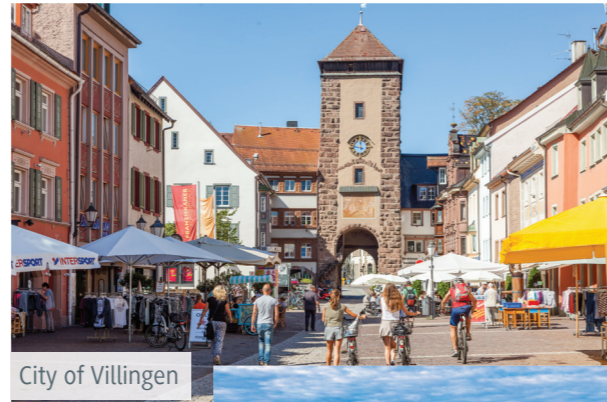
City of Villingen